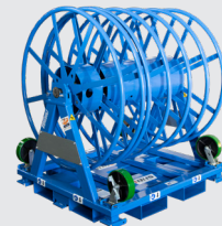
PARALLEL REEL PAYOUT SYSTEM

CONTACT THE BHS SALES TEAM FOR MORE INFORMATION ABOUT THIS PRODUCT